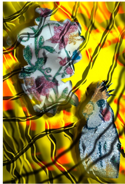
（左）張碩尹, 台北機電 #2 , 2023, 壓克力顏料、布料、鐳射 PCV、奈米碳管黑墨, 130 x 89 cm （右）吳美琪, 黃金披薩屋 , 2022, 熱轉染於緞布, 115 x 78 cm, ED. 1 of 2 + 1 AP