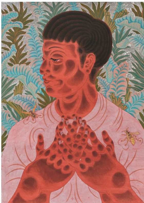
曾建穎, 夜明, 2023, 紙本設色、墨、礦物顏料、銀箔, 133 x 94 cm